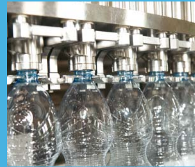
KRONES Volumetric VODM-PET