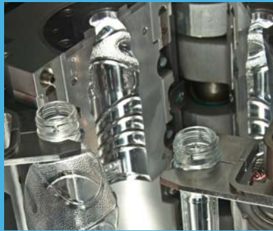
KRONES Contiform S16

The ErgoBloc L concentrates exclusively on the functions which add value and save energy and is also eminently suited for handling lightweight containers.